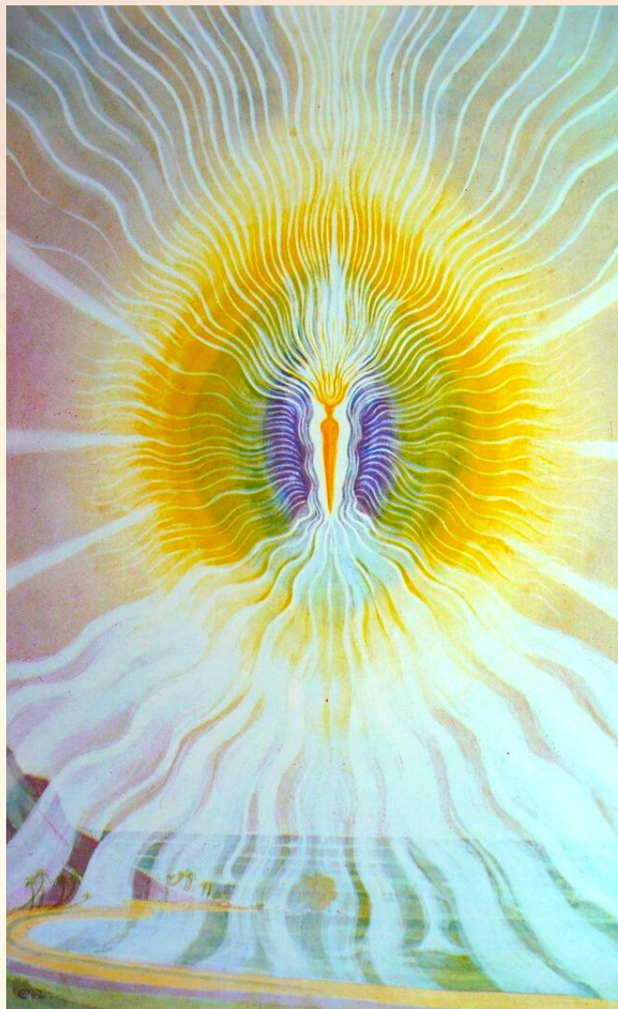
Gnosis in present-day manifestation, Ch. V, The rebirth of the Soul

To summarize: liberate the path within you for the light by means of the twofold magic of faith and life. Be absorbed by the merciful rebirth of your entire soul-state. Then you no longer need to be anxious about the rebirth of the entire state of being, as that will be an automatic result of the rebirth of the soul.)