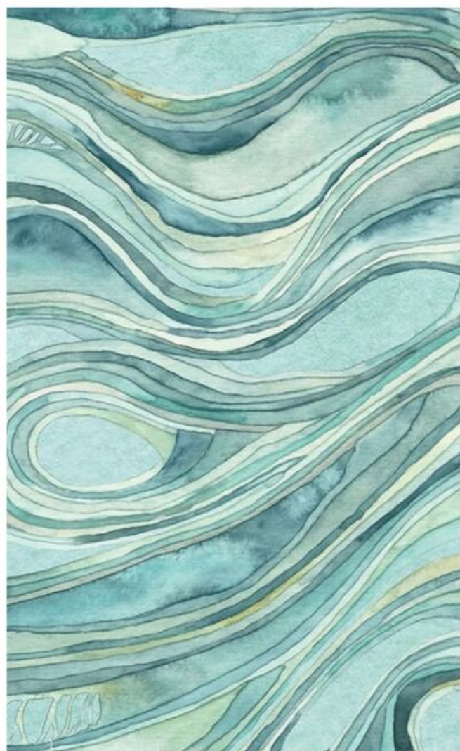
The Great Revolution Jan van Rijckenborgh, Chapter VII

These lofty spiritual teachers did not come only to bring doctrines to preach and to write. No, their task and their mission, among other things, was to preserve intact the holy etheric substance for those who were spiritually earnest in treading the way of peace which leads to the eternal doors of the new life."